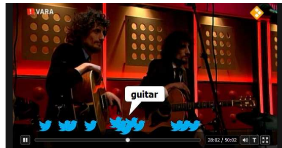
Figure 1: Video zap points, corresponding to the time points within a television broadcast at which the visual appearance of concepts designated by common terms extracted from tweets, have been detected.

Existing web services [1] allow viewers to watch missed television broadcast later on the web. However, a system that directly suggests the most interesting fragments to watch, based on social media, is, to the best of our knowledge, non existing. In our SocialZap demo, we analyze data from social media to suggest interesting concepts, zap points, in television broadcast. SocialZap uses textual information from Twitter posts related to a television broadcast of interest, which provide a rich source of information of what viewers find interesting, see Figure 1. The challenge we face is the temporal mismatch between the moment that the user tweets about a concept and the moment at which it appears in the television broadcast. The tweet-time can radically differ from the appearance-time as viewers either anticipate appearances or continue to tweet about topics that have previously appeared. To transfer the found concepts of interest from the textual to the visual modality, we use state of the art approach [8] which learns concept detectors from social media. We collect Flickr images tagged with the concept names, and we select the most reliable ones as training data for learning. Thus, the proposed system relies totally on social media data, without any manual annotations in the