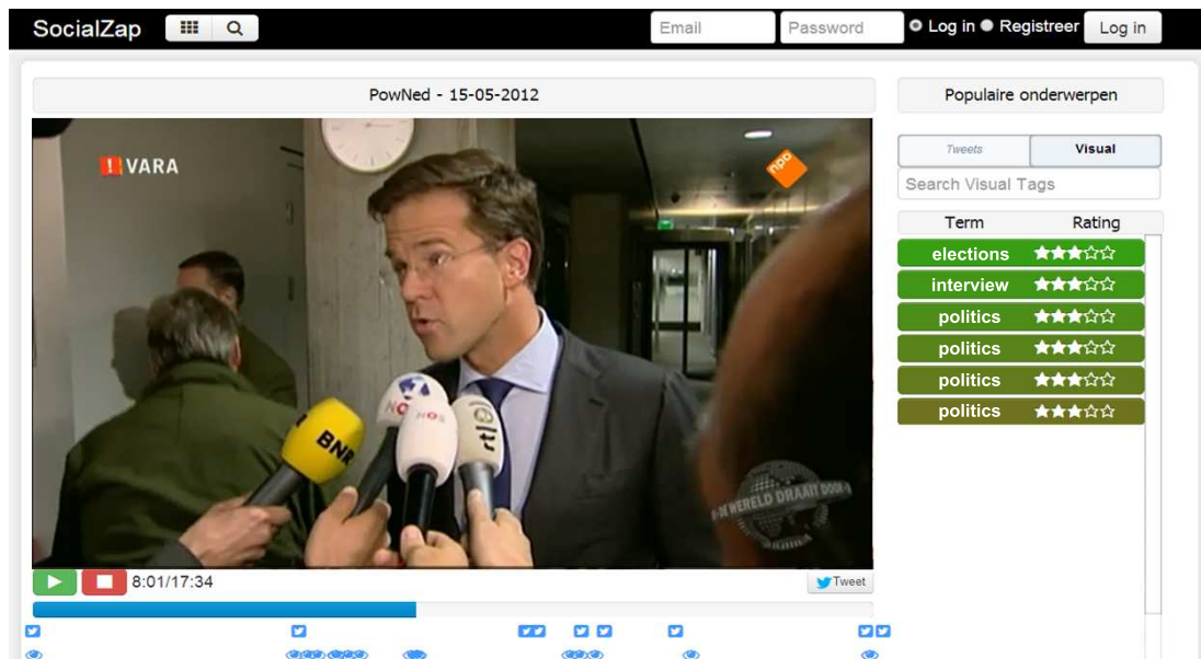
Figure 4: User Interface of SocialZap. Once the user selects a show, all found zap points are listed on the right side of the video player, ranked by importance. The user can select any zap point of interest. Once selected the interface starts playing the video at the frame where the zap point occurs.

zap points of the television broadcast. This module is the Video Indexer.